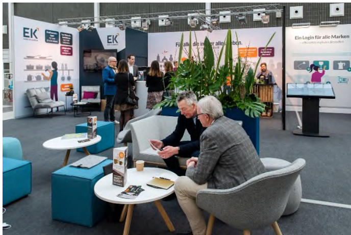
At Digital Retail presented by nmedia, visitors learn how they can expand their online business in a targeted manner.

At the upcoming Ambiente, Christmasworld and Creativeworld consumer goods trade fairs, all forms of retail will have the opportunity to gather information on the topic of digitalisation in retail, to network and to enter into a joint dialogue. In Galleria 0, in the direct vicinity of Ambiente Dining, strong online brands such as EK Retail, Kaufland and nmedia will be presenting themselves in the Digital Retail area. Together, they will show how digital business can be successfully established and professionally operated alongside bricks-and-mortar retail. The aim is to connect retailers and suppliers beyond the trade fair in order to further expand digital retail together and thus strengthen bricks-and-mortar retail.